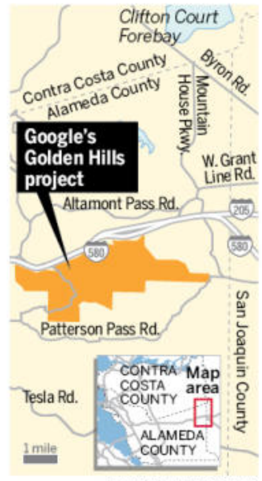
BAY AREA NEWS GROUP

"It'll be majestic," said Sam Arons, an energy strategist at Google. "Today there are many small turbines of all different sizes, all different vintages. It's kind of a hodgepodge out there. Once this project is done, you'll see a lot of tall, sleek, majestic turbines that will really de-clutter the landscape."